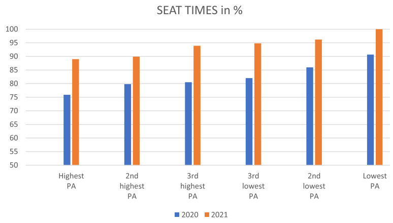
Fig. 3 Physical activity clusters directly comparing 2020 and 2021

up by an external person, and they walk through the corridors [...] Two women residents talk about their strolling plans after coffee. (Field notes, 2020)